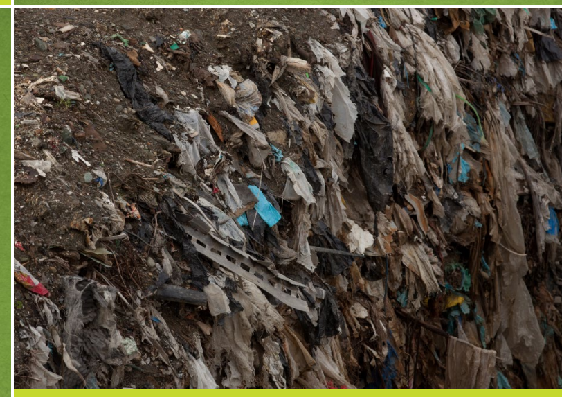
andfill: A result of the 'make-use-dispose' linear economy